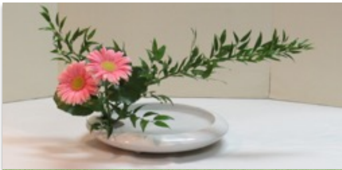
Hana-isho- Basic - Inclining Form - Variation - Low Bowl