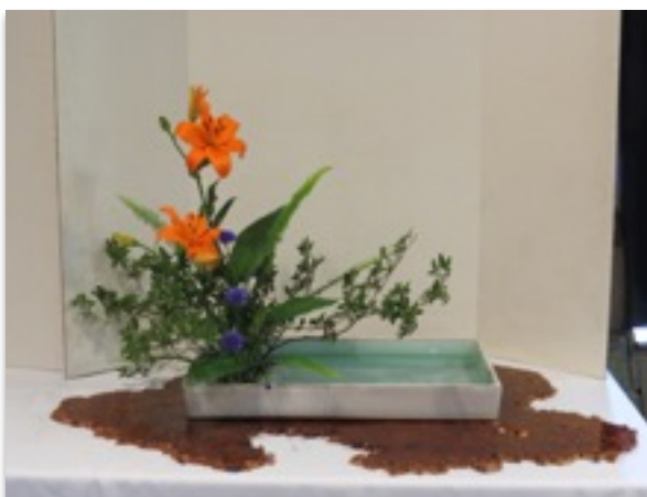
Moribana - Landscape - Realistic Method - Near View - Summer