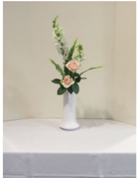
Hana-isho-Basic-Rising Form-Variation - Tall Vase