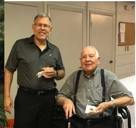
IKEBANA HUSBANDS, THE SHERPA OF THE CONTAINERS.