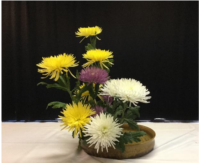
Moribana - Color Scheme - Traditional Method - Chrysanthemum - Kiku

The afternoon's moribana - Color Scheme - Traditional Method - Chrysanthemum - Kiku used only the prescribed mums in white, purple, and yellow. After diagramming the kenzans positions, and in his demonstration, José illustrated the ideal placements of how stems of each color emerged to retain the color grouping.