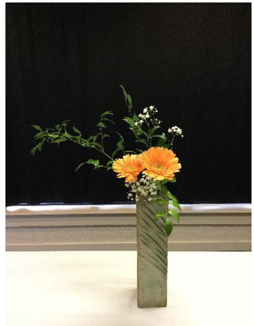
Hana-isho - Basic - Inclining Form - Tall Vase

Fall seminar began with difficult arrangements: tall vases. The morning's Hana-isho Basic Inclining Form challenged us to position Italian ruscus, fragile gerbera, and touches of gypsophilia in the ¼ region of the mouth of the container. José reminded of us of several ways to achieve desired positions by bracing against the walls of the container and using cross pieces at the end of stems rather than in the mouth of the vase.