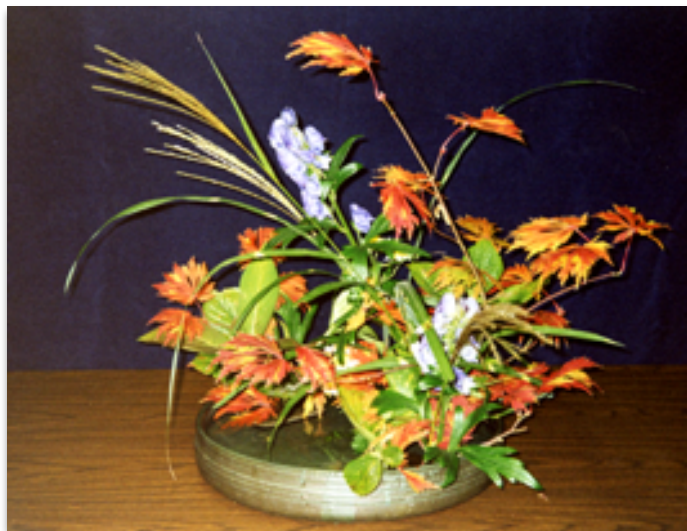
November 4th, 2000 Workshop Washington, D. C. Chapter