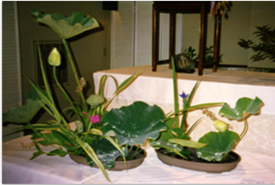
July 21st, 22nd, 23rd, 1997 Summer Seminar