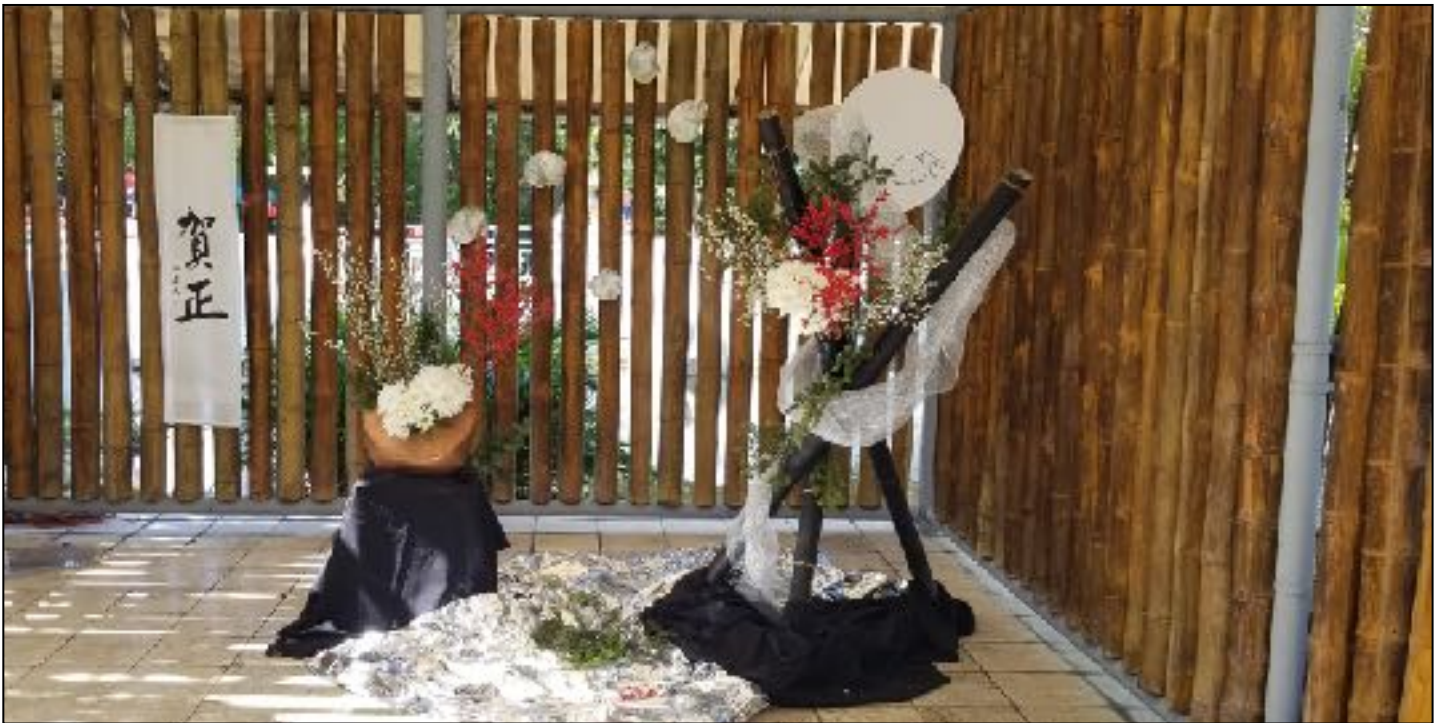
A New Year Celebration created by Ellen Weston for the Ichimura Japanese Garden, January 2023